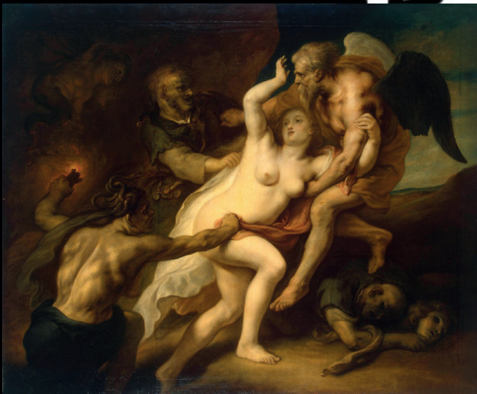
Time Reveals the Truth. The Allegory. Theodor van Thulden, 1657